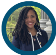
Rep. Courtney Waters