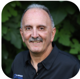
JOSEPH A. PILATO bit.ly/3T4HCXS