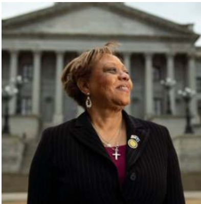
Rep Henderson-Myers House 31