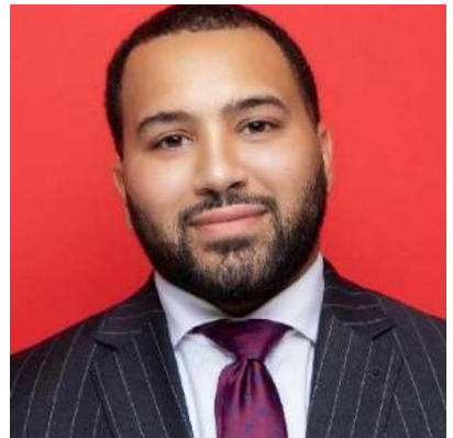
Councilman Abusoft County Council D1