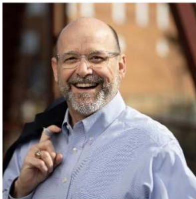
Clemson Terrugano House 33 Priority Six Candidate www.clemsontsc.com